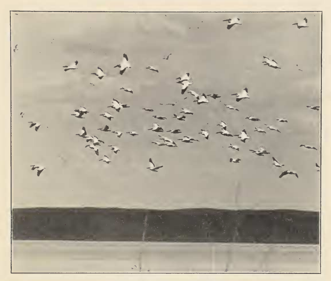
A FEW OF THE PELICANS "One of the most impressive and most majestic fliers among American birds."